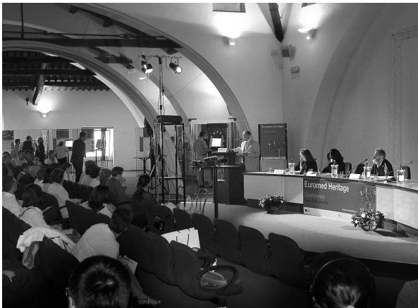
The Euromed Heritage Conference

Partners in projects carried out or planned within all three phases of the MEDA funded Euromed Heritage Regional Programme, managed by the European Commission's EuropeAid Cooperation Office, met for the first time at a conference held from 17 to 19 June in Rome under the title 'A Tangible example of Dialogue between Cultures'. Over 300 participants exchanged information, ideas and best practice, and discussed the Programme's place within the wider framework of the Barcelona Process. A strong media attendance was noted. The Conference was organised by the two members of the Consortium in charge of co-ordinating the Programme's implementation, the Italian Central Institute for Catalogue and Documentation (ICCD) and the Centre Città d'Acqua of Venice.